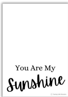
Full page art template